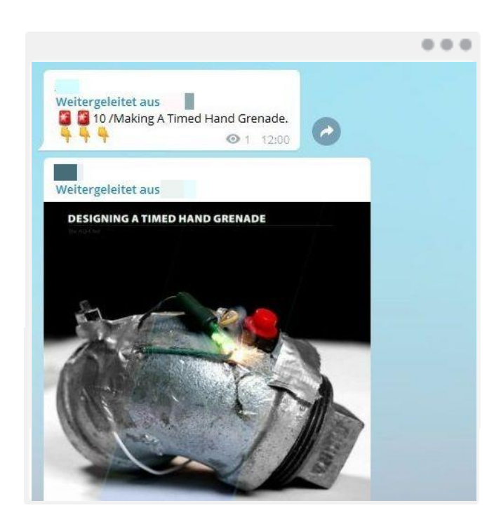
Image of a pipe bomb with step-by-step instructions on how to build it.

At the same time, jugendschutz.net observed a focus shift of Jihadist propaganda in 2018: more and more calls for attacks with detailed instructions on how to carry on the fight 'at home' (i.e. in the users' home towns). On Telegram, practical guidance for the fight 'at home' could be found, for example on how to build bombs and carry out bomb attacks.