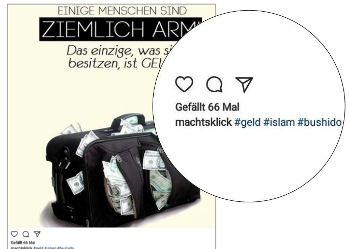
Hijacking hashtags: Tagging content with youth oriented keywords shall lure young users.

Far-reaching images with uncritical Islamic religious content often also attract 'likers' and commenters with extremist ideas. jugendschutz.net observed how German Salafist players comment on particularly popular images in order to attract attention to their own subtle profiles designed to specifically target young people.