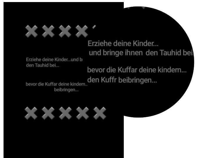
Feature targeting youths: Salafist 'story' arouses fear of 'non-believers' among a female target group.

The 'stories' automatically disappear 24 hours after being shared. This makes the function so popular since it is a great way to easily share a number of posts and avoid profile overload. The fleeting nature of the stories makes endangering content difficult to control. When young people stumble across Islamist 'stories' the risk is hardly calculable.