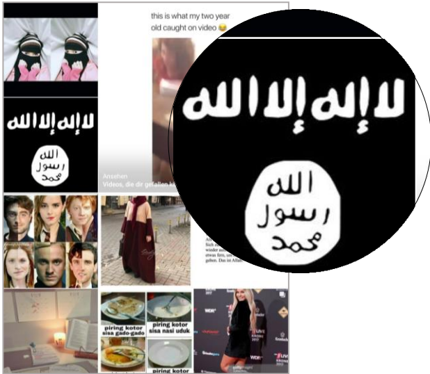
Explore feed: The forbidden IS symbol shows up between stars of the Harry Potter films and a well-known beauty blogger.

When searching for up-to-date political topics such as the war in Syria or the Muslim ethnic minority of the Rohingya, persecuted by Myanmar's military, images and videos of atrocities appear in the explore feed the next time the Instagram app is opened. It is only very rarely that this is verifiable information about war crimes. In many cases, depictions of dead or seriously injured children, of persons exposed to massive violence are posted from extremist profiles. In addition, the explore feed also makes automated suggestions for explicit jihadist propaganda such as videos and images of the terror organization 'Islamic State' (IS), for instance, after a search for 'caliphate'. This is how users can also come across gruesome images of executions and torture on the platform.