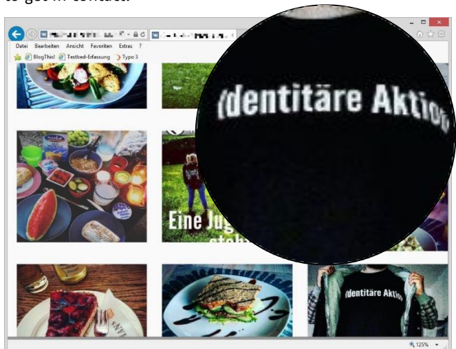
'Identitarian food blog': Activists disguise their propaganda as hip content, close to reality

In their social media strategy, the 'Identitarian movement' also relies on their members' private accounts which they integrate into their main channels. At first sight, the profiles seem innocuous, e.g. they give self-defense tips or present 'food porn'. A pleasant layout, day-to-day topics and addressing users personally shall make them feel more at ease to get in contact.