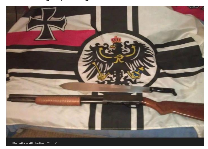
Misanthropic Division: Supporters of the group present their weapons on VK.

The Russian neo-Nazi movement 'Misanthropic Division' disseminates its militant and inhuman propaganda on this platform. They post photos of visits to concentration camp memorials along with mocking comments or post anti-Semitic memes and make the corresponding links available to a wide user group through social media.