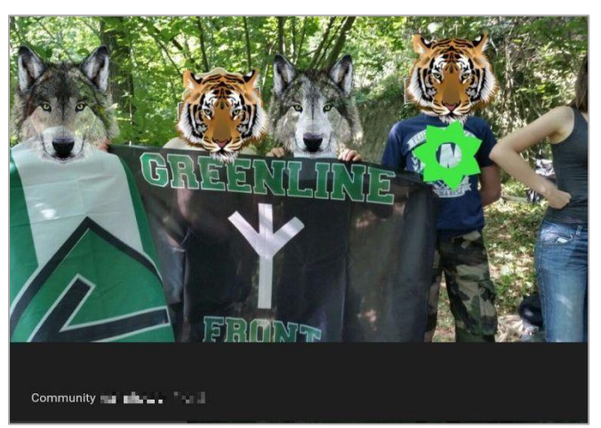
'Greenlinefront Deutschland': Neo-Nazis lure with nature conservation and animal protection

Disguising themselves as conservationists or animal rights activists is one strategy of right-wing extremist groups. In order to approach young people, neo-Nazis of the Misanthropic Division act as 'Block Widar' or 'Greenlinefront Deutschland' and give the impression of being environmentally conscious. Instead of weapons and munitions they show images of cleanup activities in German forests, instructions to build bird boxes or outraged users talking about cruelty to animals.