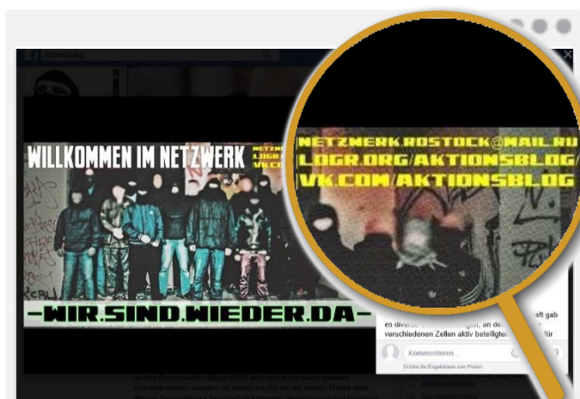
After deletion on Facebook: The national socialist "Aktionsblock" increasingly turns to VK.

In order to reach a maximum audience, right-wing extremist groups still primarily make use of the major social media platforms like Facebook or Twitter. VK, however, plays a key role in extremists' social media mix as a 'censorship-free' alternative for spreading illegal content and networking at international level. Cross-linking leads users from the big platforms to individual posts or pages on VK.